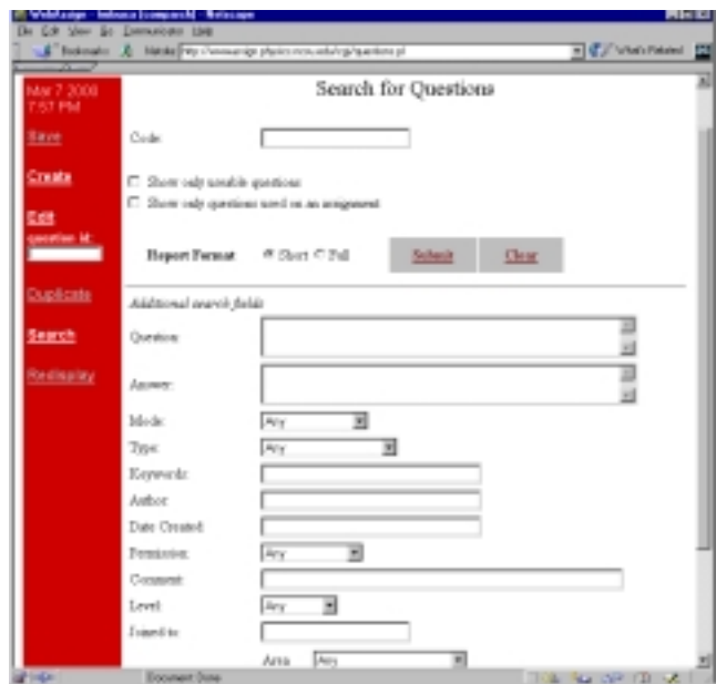
Figure 2: Search screen