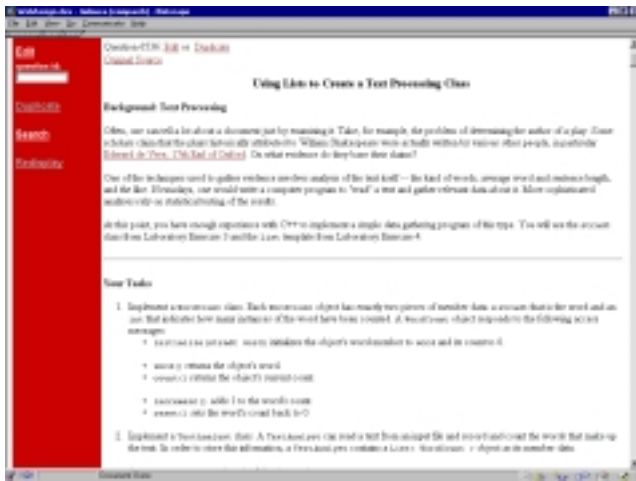
Figure 4: Search result (full)

differs from ours in two important ways: First, our software is designed to import problems from arbitrary Web pages rather than limiting its