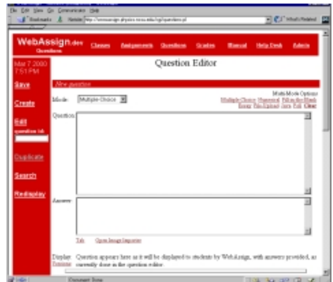
Figure 5: Create question screen

"The authors of the material in this database grant authorized users of this database permission to reuse it for educational purposes in their own courses. Any further republication of the material requires the express consent of each author whose intellectual property is being reused."