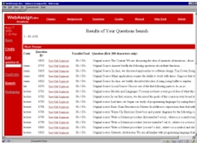
Figure 3: Search results (short)

Though most of the material so far has been contributed by faculty at research institutions, there is great potential for expanding the database by promoting it to instructors at undergraduate colleges and universities. When the Computer Architecture database was demonstrated at the 2000 SIGCSE conference, dozens of instructors expressed interest in using it. With most institutions now using o-o languages in their introductory programming sequence, demand for reusable o-o materials should be even higher.